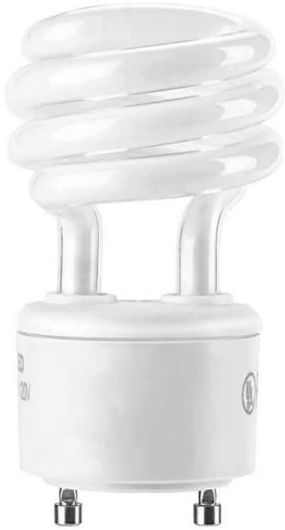
GU CFL base