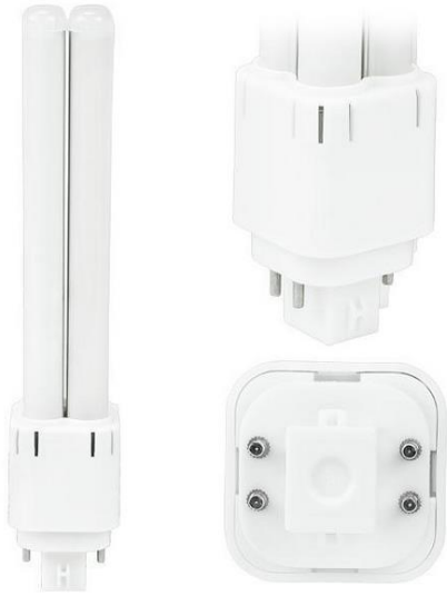
Four-pin CFL base