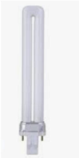
Two-pin CFL base